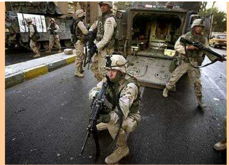
U.S. soldiers are shown at the site of attacks in central Baghdad, November 21, 2003.

Top 10 National News Story Briefs and Headlines, with links to the Full Stories