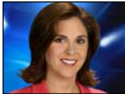
Action News Team